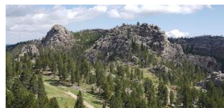
The Black Hills of South Dakota.

We found out later that a number of people complained about having to leave before they finished the walk. The walk instructions are very clear that if there is thunder or lightning, everyone will have to leave the mountain for their safety. No refunds are given.