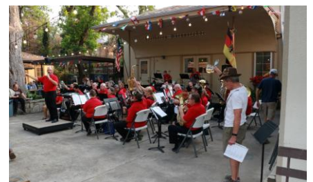
Beethoven band playing during the manifest celebration.