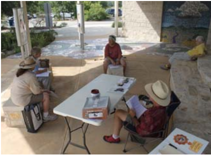
Officers of the TVA meeting at the covered pavilion after the Summer Crownridge Canyon Natural area YRE walk 7/28/12.