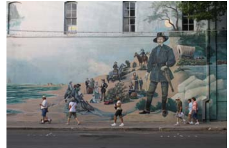
Walkers passing mural painted on the antique wall showing the first German settlers arriving in Texas who eventually settled New Braunfels at the TVA New Braunfels Railroad Museum walk 8/4/12