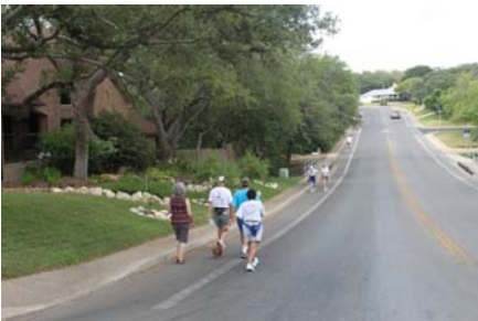
Walkers at Sunrise walk – Deerfield subdivision.

Write for more information to: PO Box 572 Castroville, TX 78009 Contact: Ashlee Bates, (830) 538 - 3142 E-Mail: ashlee@castroville.com