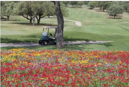
Wild flowers on the Ft. Sam Houston Golf Course at the Fiesta Walk