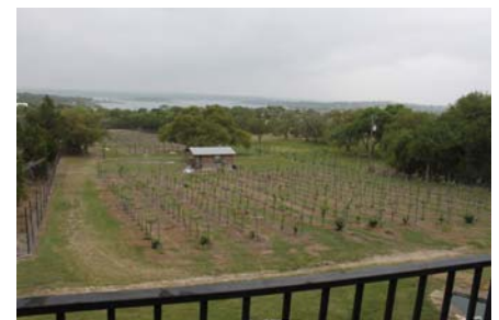
Fawncrest Vineyards- Canyon Lake walk