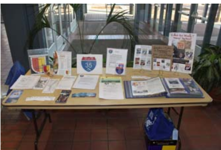
35 on 35 & OST Special Events table at Trinity event.