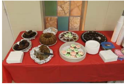
Goodie table at Boerne Walk