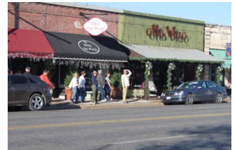
Downtown Boerne @RR walk event

past events. Each photo should include your club name and number, information about the event (date, location, as much as is known), and who is in the photo. Send photos to: Kim Young, 701 S 25th Ct., West Des Moines, IA 50265. If you need the photos returned, you must put your name and address on the back of each photo. They will be available for pickup at the convention or returned by mail if a stamped self-addressed envelope is included. Photos may be emailed as an attachment in tiff or jpeg format to: kimyoun1981@gmail.com . Be sure to include all the identification information in your email.