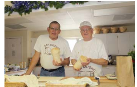
San Antonio Loafers at Boerne Walk