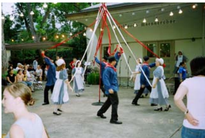
Maypole dance at Beethoven Maennerchor Halle und Garten – Beethoven/King William Event