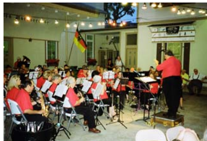
Beethoven Maennerchor Halle und Garten Orchestra