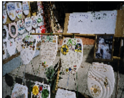
*The famous Toilet seat Museum at the Trinity Events

But no matter how many avenues you advertise in and what form it takes, you also need well crafted messages to get publicity. That will be our next topic.