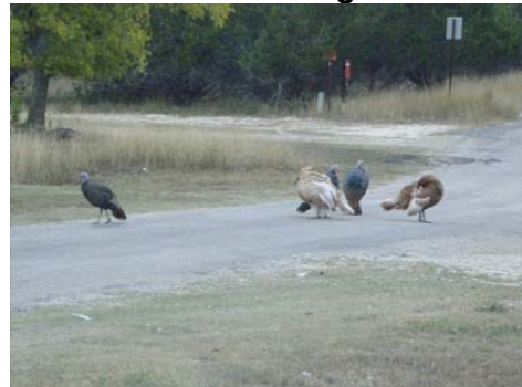
A few of the locals joined walkers at the Waring event - 10/25/08 & 10/26/08