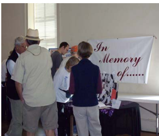
St. Joseph's Halle – Fredericksburg start point