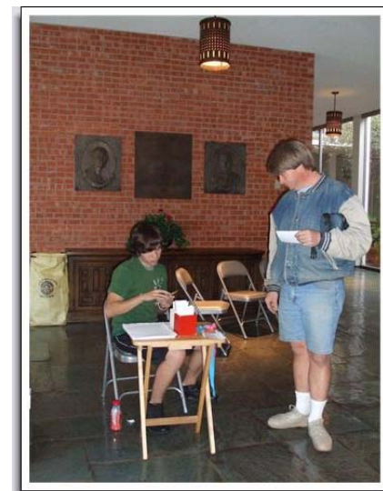
Working the start at Trinity