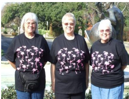
Three sisters at the Trinity walks!