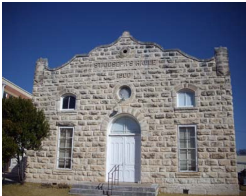
12/31/07 - Fredericksburg Walk