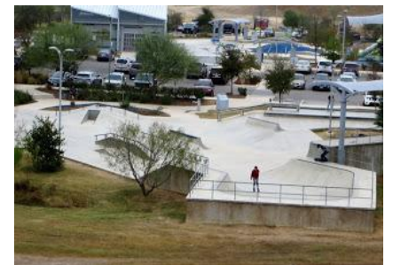
Pearsall Park Skate Park