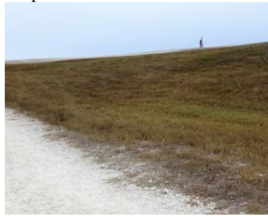
One of the many hills!

were lots of open areas with no shade at all. The trail went up and up and up at one point. Overall, though, the whole walk was up and down the hills through the park.