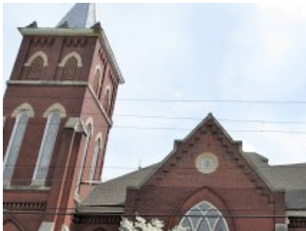
Edgefield Baptist Church - our start point

The walk sign-in point for this 5km Volksmarch (which is a walk around a neighborhood in East Nashville, Tennessee) was located at a skateboard shop. From there, we drove a few blocks to the walk start at Edgefield Baptist Church. This walk is described as an "Urban hike."