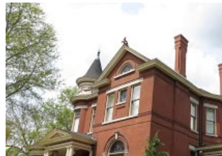
The gargoyle house.

The next two photos are of the "gargoyle house" which, luckily, did not get destroyed in the 1916 fire in this neighborhood.