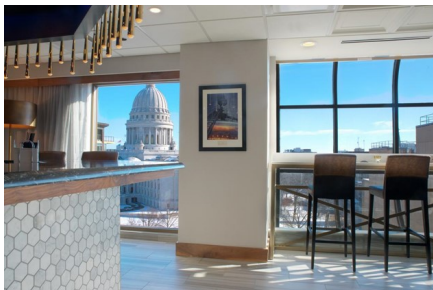
View from the Madison Concourse Hotel

Convention workshops and the General Membership meeting will be hosted in the Monona Terrace Community & Convention Center located at One John Nolen Drive, Madison, WI 5370. http://ava.org/2021-convention/