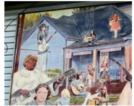
Fanny's House of Music Mural

The mural on the side of Fanny's House of Music is awesome. It depicts influential women guitarists, such as Joan Jett, Dolly Parton, Taylor Swift, Suzie Quatro, Maybelle Carter, Joni Mitchell, Joan Baez, Loretta Lynn, Sister Rosetta Tharpe, Bonnie Raitt, and more.