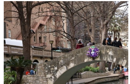
Following the Riverwalk trail walk route.