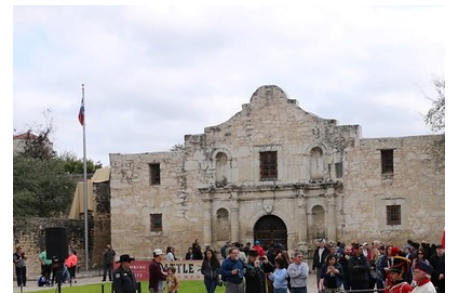
Re-enactors portraying the arrival of the Mexican Army at the Alamo.