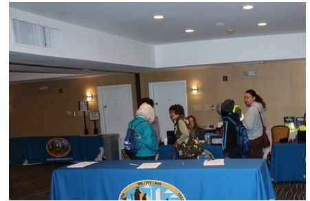
Inside the registration room