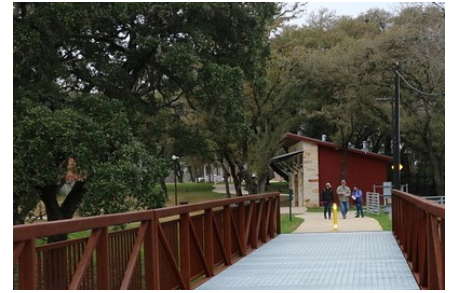
Crossing the Bridge to the Library