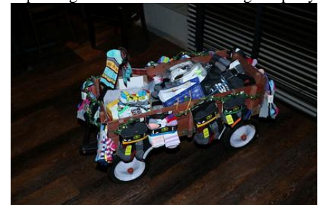
The wagon full of donated children socks.