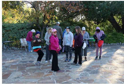
Volkssporters at the registration area for the Texas Trail Roundup club's Japanese Tea Garden Walk.