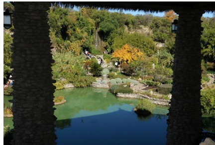
Japanese Tea Garden and pond below.