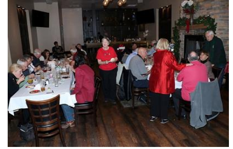
The Christmas party room at Stone Werks Big rock Grille.