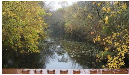
Crossing Salado Creek on the Park walk route.