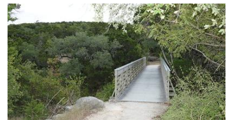
The trail through the park