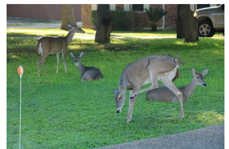
Local participants at the event.