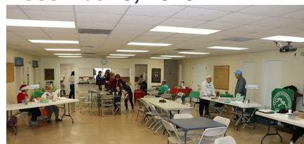
The start point at Luther Hall, St. John's Lutheran Church.