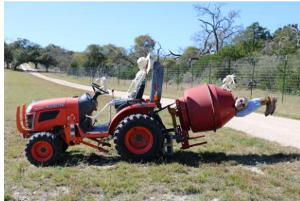
Tractor and cement mixer displayed at the entrance to a ranch along the trail decorated for Halloween.