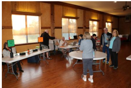
Registration taking place inside Waring Hall for the Waring Halloween Walks that took place on 27 October 2018. This was the 39th annual Halloween Walk sponsored by the Hill Country Volkssportverein.