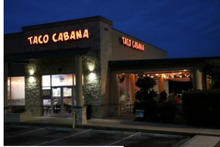
Start Point Taco Cabana