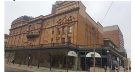
Pabst Theater – Wells & Water Streets.

The route goes along the Lake Michigan shoreline for awhile, and then runs along the Milwaukee River and through the Historic Third Ward, a trendy fashion and arts district. We met some friendly mounted police who let us pet their horses.