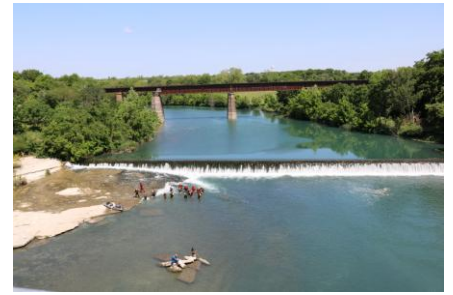
View from the Faust Street Bridge along the walk route.