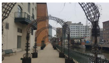
Riverwalk between Kilbourn & Wells St.

I flew to Milwaukee on April 12 and my cousin and her mother (a different aunt) met me at the airport and we went to do the YRE in downtown Milwaukee. This was the nicest weather of the trip with temperatures in the low 60s to upper 40s. My cousin and aunt were able to do the 6K with me and then went shopping at the downtown mall while I finished the 10K.