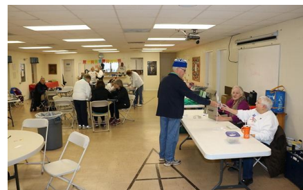
Start Point at Luther Hall, St. John's church