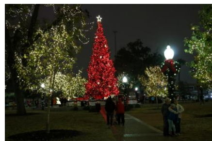
Travis Park along the route at the Christmas Lights River Walk Event 12/17/17.