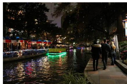
River Walk lights on the route 12/17/17.