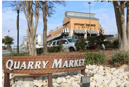
Corner Bakery Start Point - 1/6/18