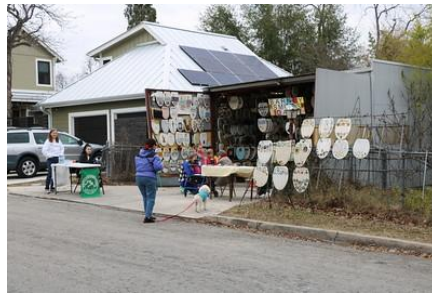
Gail Weinraub and Rudy at 2nd check point located at Barney Smith's Toilet Seat Lid Museum.

RANDOLPH ROADRUNNERS PO Box 2744 Universal City TX 78148-1744