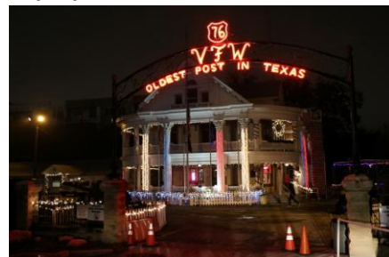
VFW Post 76 - Start Point - LoneStar Walkers Event.