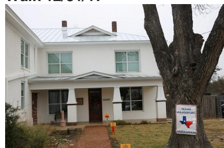
Start point for the 12/31/17 TVA Memorial Walk Fredericksburg at the Social Hall, First Methodist Church Historic Sanctuary.