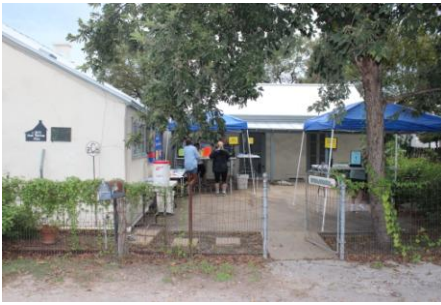
The start point for the 1 October 2016 Castroville Walk that was at the Jean Merian House built Circa 1851. The house serves as the Castroville Chamber of Commerce building