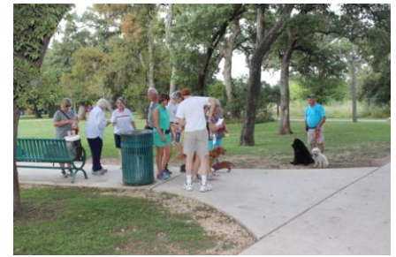
First checkpoint - Walker Ranch Trailhead.