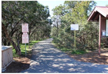
Eisenhower Park – Yucca Trail 1/30/16