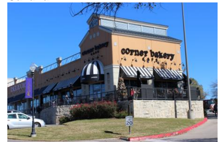
Quarry Market/Museum Walk 1/9/16