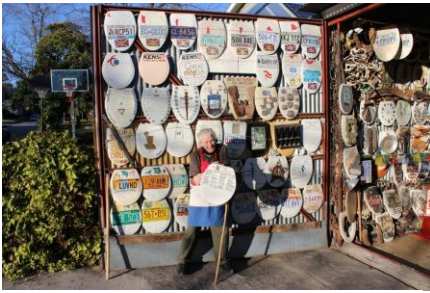
Barney Smith's Toilet Seat Lid Museum 1/9/16.