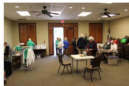
Workers and Walkers at the Start Point for the Del Webb Hill Country Resort Walk event 2/13/16