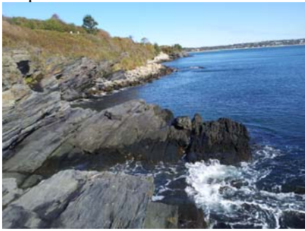
Newport RI Day 10 saw us in RI, starting in Newport which featured the breathtaking Cliff Walk along the ocean's rocky shore. We also did the Capital Walk in Providence with more historic homes and buildings.

restaurants. On day 8 we headed to Salem MA which was gearing up big time for Halloween – witches everywhere. We also stopped in the seaport town of Gloucester, where The Perfect Storm was filmed. Day 9 was spent in Boston walking the historic freedom trail and checking out the shops and restaurants.