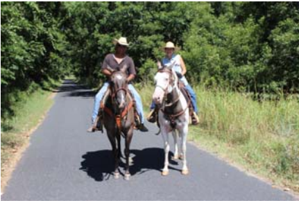
A couple riding horses on Gaddis Bluff Road in Comfort stop for a picture.