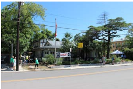
Start point at Beethoven Mannerchor Halle