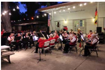
The band at the Maifest at the Beethoven Mannerchor und Garten.