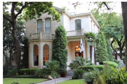
303 King William which is known as the Stevens/James House and was built in 1881 of native limestone