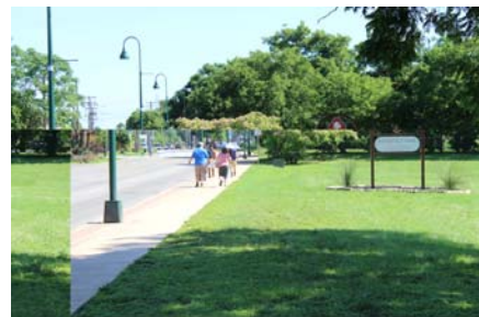
Volkssporters on the left follow the trail past Roosevelt Park on the way to the first check point.