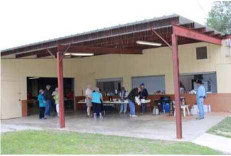
Workers & walkers at the Comfort Easter Walk event – 4/4/15