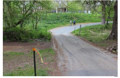
Walkers on the trail at Comfort Easter Walk – 4/4/15