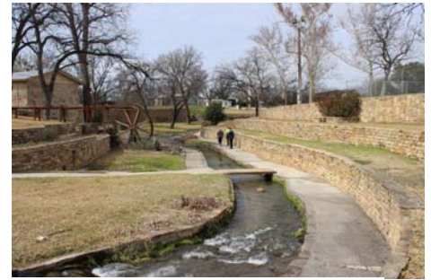
Mill Pond House – San Saba Springs walk.