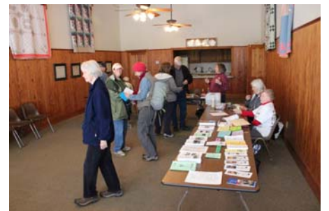
Brady walk event Start/Finish tables at Brady National Bank Community room.