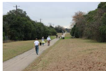
Volkssporters following the route along the Number 9 Greenway trail.