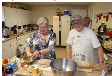
Members of the San Antonio Loafers Club cook their delicious homemade bread for the walkers at Boerne.