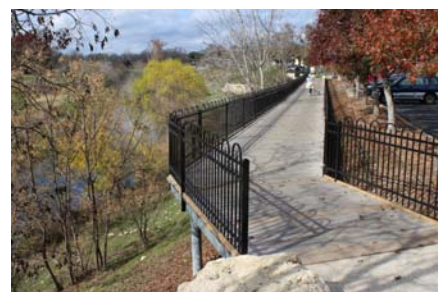
The boardwalk along Cibolo Creek to the trailhead at Main Plaza.