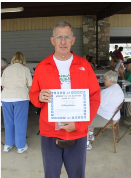
Comfort Easter Walk & Awards 3/2013