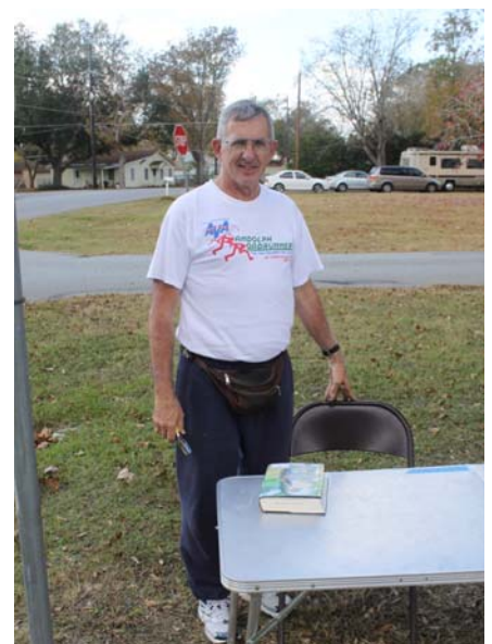
Smithville Walk 12/2012