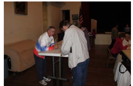
Fredericksburg Midnight walk 1/2012