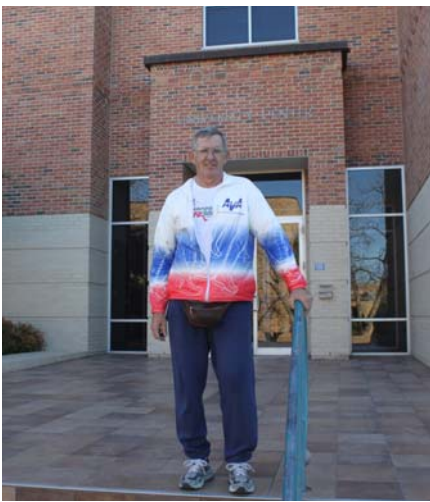
St. Mary's University 1/2012