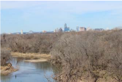
A view of the Austin skyline from turn-around point on bridge.