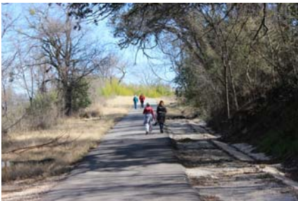
Walkers coming and going along the trail to the first check point at Austin Parks walk 2/15/14