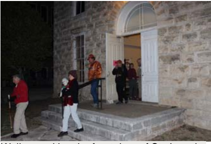
Walkers exiting the front door of St. Josephs Halle to start the walk after the church bells have struck in the new year.