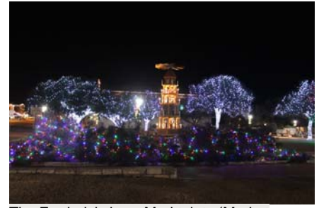
The Fredericksburg Marktplatz (Market Square) decorated for Christmas.

RANDOLPH ROADRUNNERS PO Box 2744 Universal City TX 78148-1744