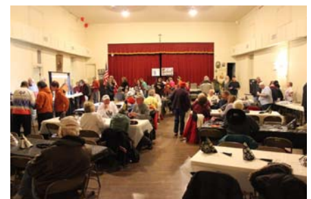
Midnight walk start point St. Joseph's Halle, Fredericksburg - 1/1/14