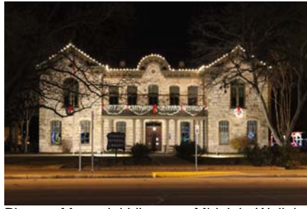
Pioneer Memorial Library at Midnight Walk in Fredericksburg.