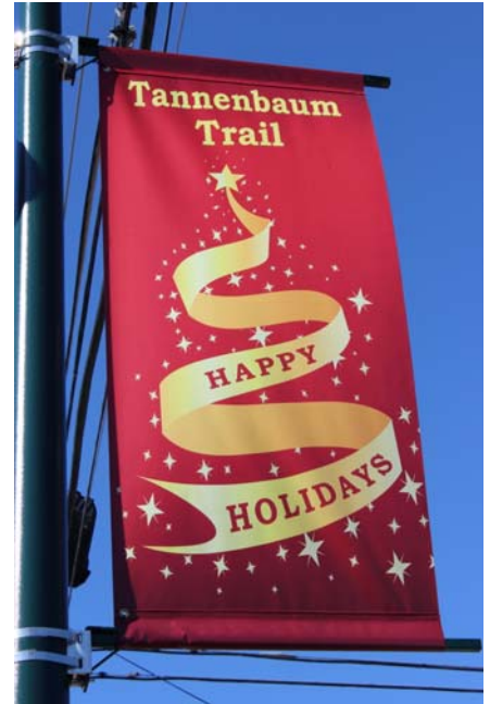
Boerne holiday street banner along the walk