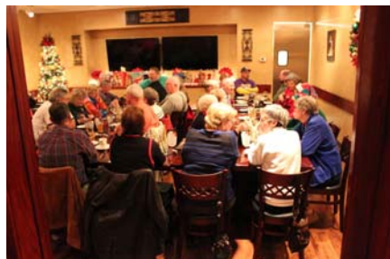
River City Seafood & Grill party/dining room.