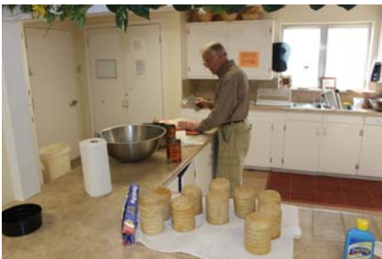
Coffee can bread baked by the San Antonio Loafers.