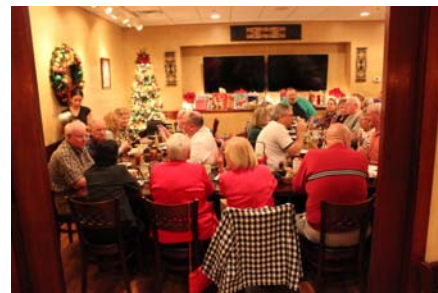
River City party/dining room