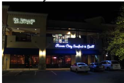
River City Seafood & Grill Restaurant.