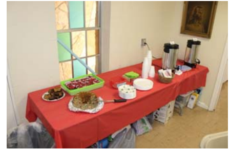
Refreshment table at the start point.