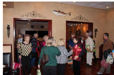
End of the night.