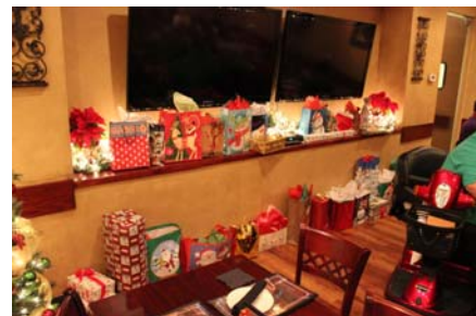
Chinese auction gifts.