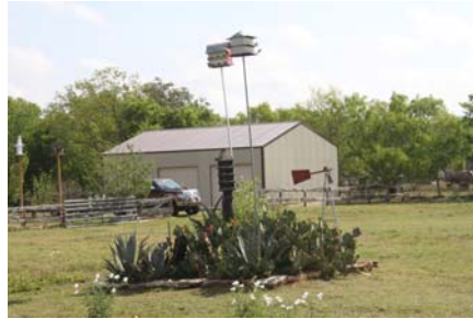
Purple Martin houses - Somerset walk.