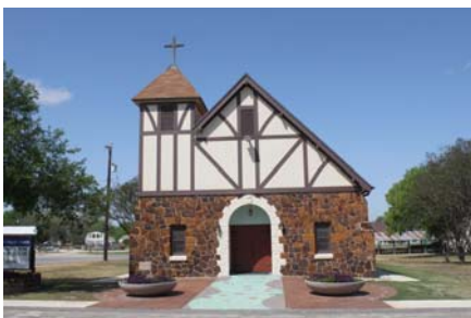
St. Mary's Catholic Church built 1933 - Somerset Walk.