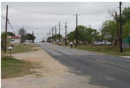
Walkers headed out - Somerset walk.