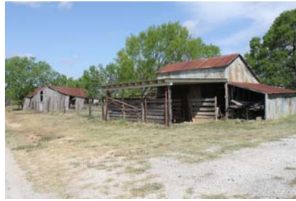
Old farmstead - Somerset walk.