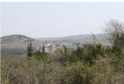
Kerrville Singing Wind Spring walk event.