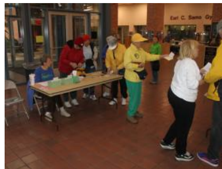
Start Point – Bell Athletic Center-Trinity U.

Don't forget the "try"athalon on 9 February at the beautiful Del Webb Hill Country Resort. Two different 5 km / 10 km walks and a bike event. Polish your bike and get air in the tires for the RR's once in a blue moon bike event.